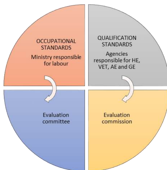
Figure 3.1: A procedure for entry into the CROQF Register starts at the request of any legal entity or a natural person, as well as at the request of national authorities providing that their interest has reasonable grounds.

A request for entry into the Sub-register of units of learning outcomes and the Sub-register of qualifications standards is submitted on a prescribed form to the Agency for Science and Higher Education for qualifications at levels 5 (in the part that relates to higher education); 6.st; 6.sv; 7.1.st; 7.1.sv; 7.2; 8.1; 8.2, and the Agency for Vocational Education and Training and Adult Education for qualifications at levels 2; 3; 4.1; 4.2, and level 5 (in the part that relates to specialist vocational training).